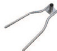
Drive-on Car foot